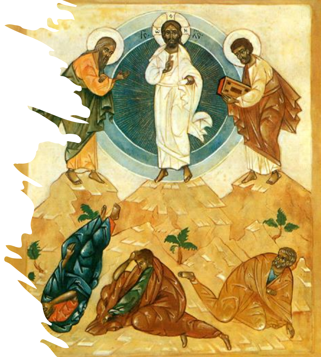
Transfiguration of Our Lord